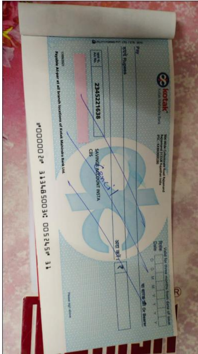
Cancelled Cheque of Account belonging to Prateek Lakhotia